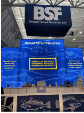
Beaver Street Fisheries