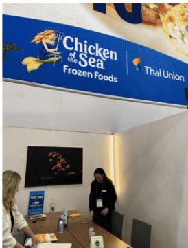
Thai Union/Chicken of the Sea Frozen Foods