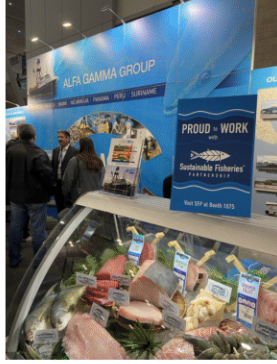
Alfa Gamma Group