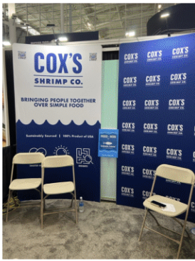
Cox's Shrimp Co.