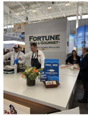
Fortune Fish & Gourmet