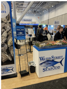
Water Street Seafood